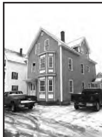
208 Conant Street, 50 Dubuque and 49 Rimmon Street, the three West Side properties supported by the Housing for Everyone Award presented by the TD Charitable Foundation.