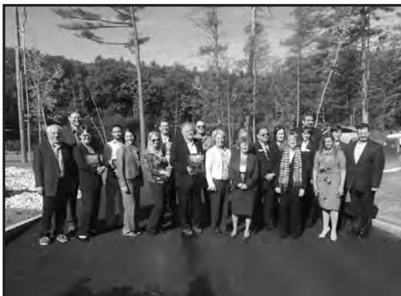
Representatives from our financial partners and development team for Hidden Pond Apartments accept plaques at the September Ribbon Cutting in Amherst.

On October 11, 2013 we hosted a ribbon cutting at Hidden Pond Apartments, our new 28-unit affordable housing development in Amherst. Funders, partners, residents, members of the Board of Directors and Trustees were all in attendance to help open these new units and recognize those who made this initiative possible. All of the units were rented and occupied by the end of November. Thank you to Merrimack County Savings Bank for sponsoring this event.