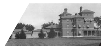
The Straw Mansion circa 1870. MNHS will be renovating this historic property as part of the Renaissance 7 project.